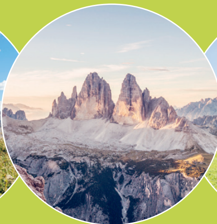
Tre Cime di Lavaredo Drei Zinnen Three Peaks