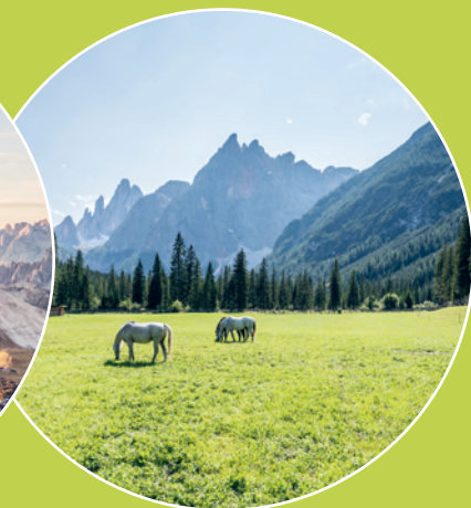
Val Fiscalina Fischleintal Valley