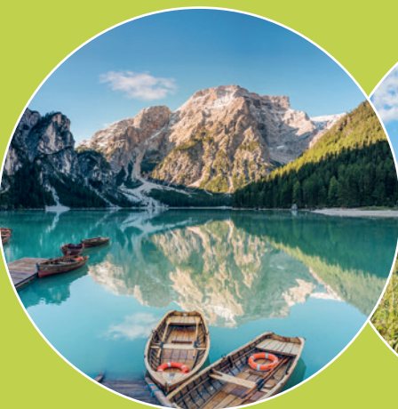
Lago di Braies Pragser Wildsee Lake

Da scoprire in modo sostenibile Sanft erleben To enjoy in an eco-friendly way