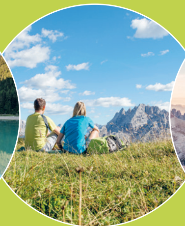
Prato Piazza Plätzwiese High Plateau